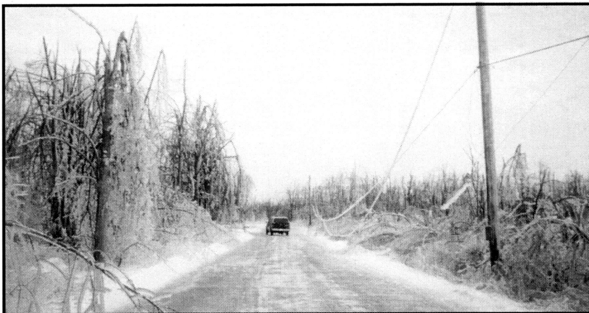
Scenes from the 1998 Ice Storm