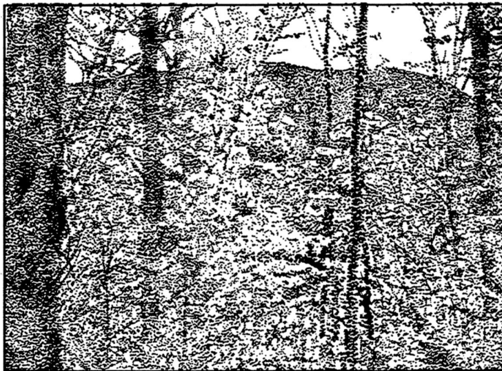
The Bowl artist: Lucy Tyrrell

The Bowl is a 607-hectare cirquelike watershed located in the White Mountain National Forest (WMNF) near Wonalancet, New Hampshire. Within the Bowl, a 206-hectare RNA (as well as an additional 445-hectare proposed expansion) has been the site of a long history of environmental research. The steep cirque walls and deep tills of the RNA were formed by glacial action during the Pleistocene. Significantly, there is no evidence of logging or fire in the area. Many trees there are 400 years old or older.